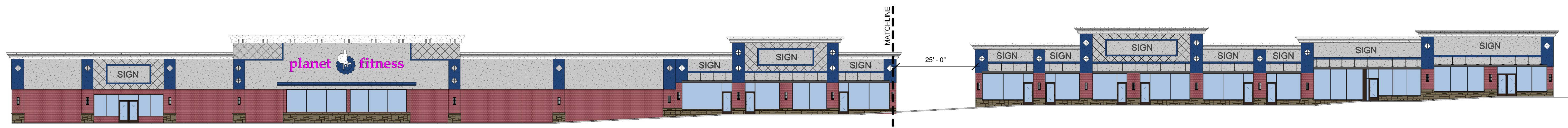
③ OVERALL ELEVATION 1/16" = 1'-0"