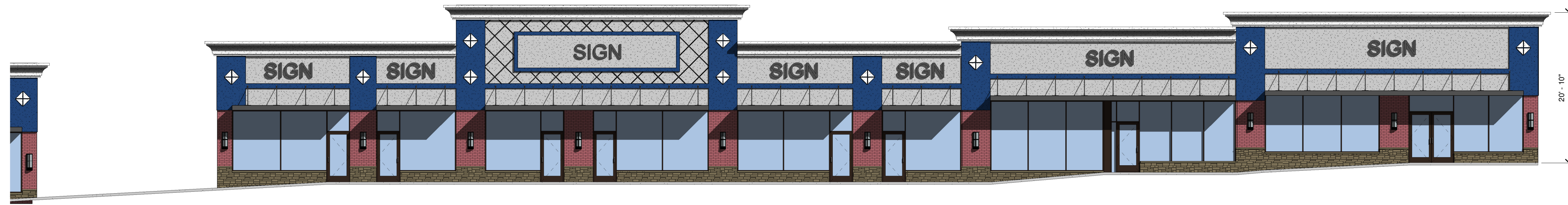
① ELEVATION 1/8" = 1'-0"