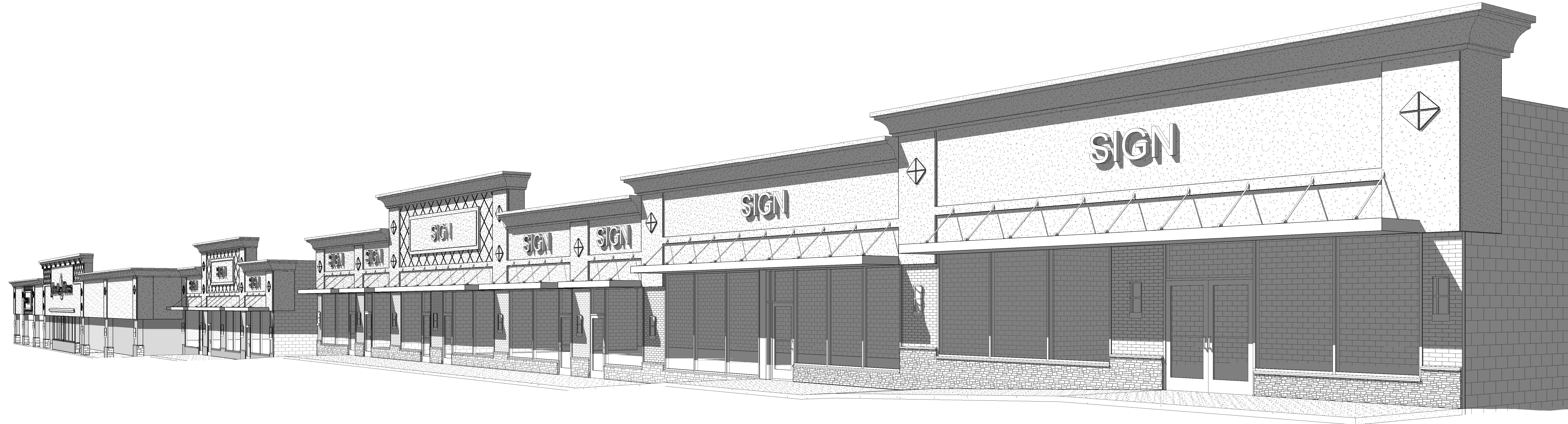
1 PERSPECTIVE VIEW