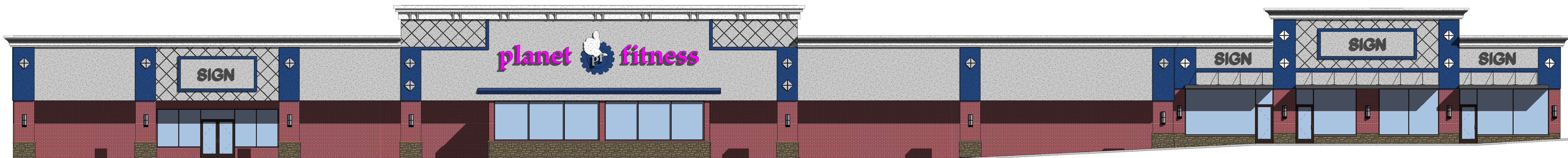
② ELEVATION 1/8" = 1'-0"